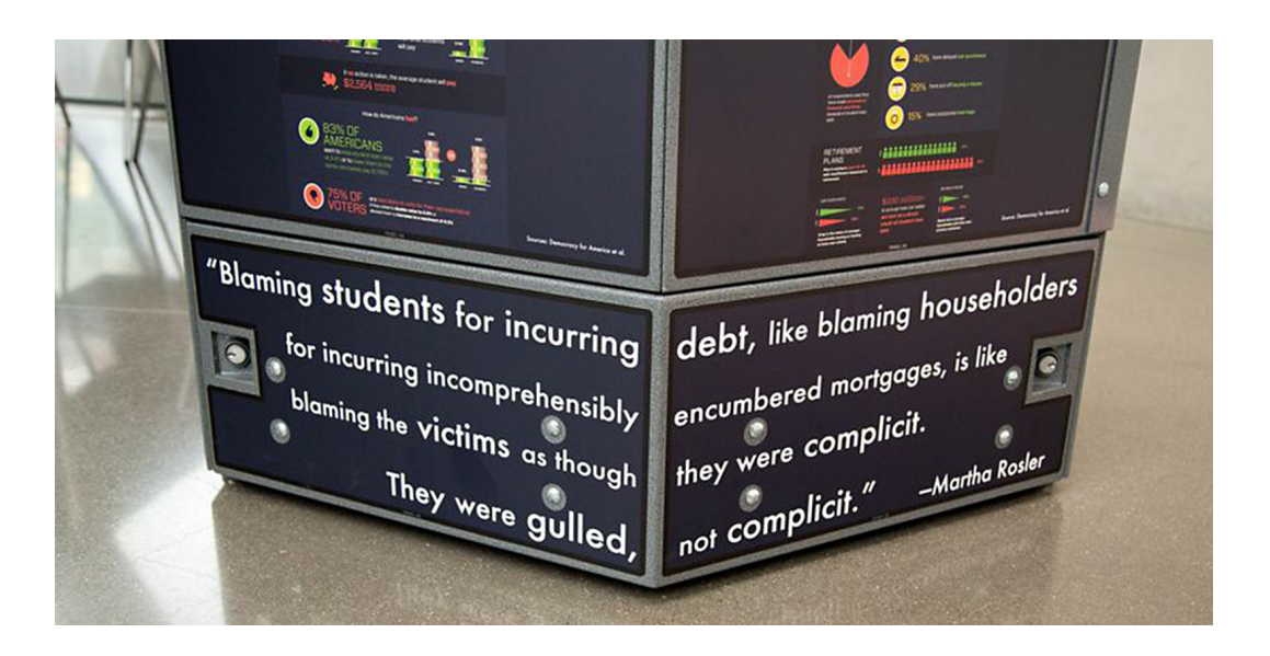
Figure 2. Martha Rosler, Coin Vortex for Student Debt, 2014. Courtesy of the artist. Photo: Aaron Word.

The text on the base of the installation reads: "Blaming students for incurring debt, like blaming householders for incurring incomprehensibly encumbered mortgages, is like blaming the victims as though they were complicit. They were gulled, not complicit".