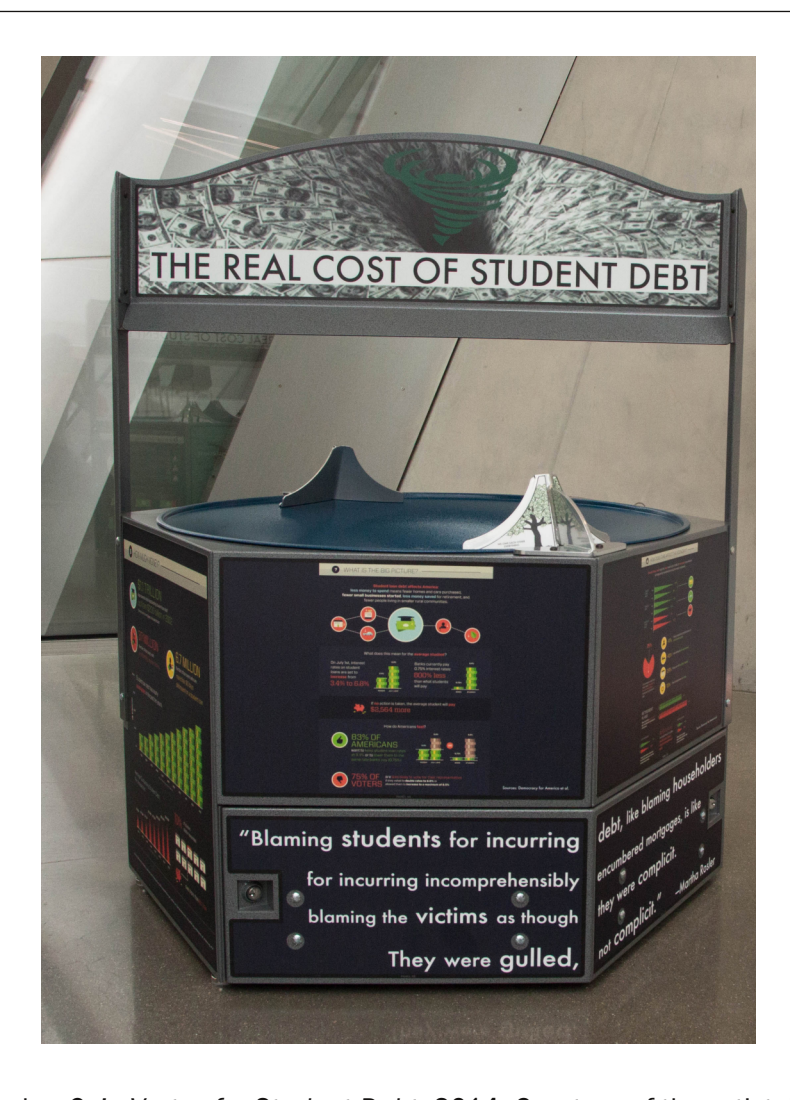
Figure 1. Martha Rosler, Coin Vortex for Student Debt, 2014. Courtesy of the artist. Photo: Aaron Word.

The text on the base of the installation reads: "Blaming students for incurring debt, like blaming householders for incurring incomprehensibly encumbered mortgages, is like blaming the victims as though they were complicit. They were gulled, not complicit".