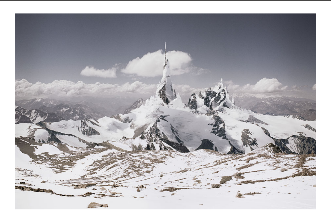
Figure 4. Michael Najjar©, nasdaq_80-09. Courtesy of the artist. <a href="http://www.michaelnajjar.com/">http://www.michaelnajjar.com/</a>

In High Altitude , Najjar also references the eroding boundaries between reality and simulation when he observes: "If the focus used to be on the exchange of goods and commodities, it is now securely on the exchange of immaterial information" (quoted in Anti-Utopias, 2010: Paragraph 4). The images in High Altitude , like works such as The Lost Horizon by artists Mathew Cornford and David Cross, appropriate the metaphors of mountain landscapes to destabilize the promotional signification of the financial industry. As Alistair Robinson (2014: 139) observes: "Each rise and fall is represented as part of a landscape that pushes and pulls at the earth, with market movements becoming monstrous forces being unleashed from under the earth's crust".