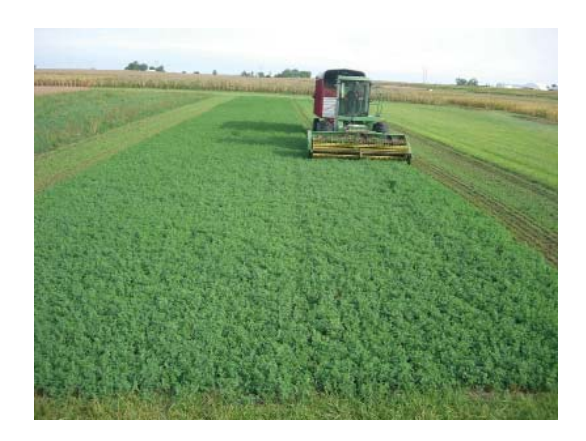
A4 harvest, 2012.

4. Distribute results and insights from this project to farmers, agricultural industry professionals, extension personnel, scientists, policy makers and members of the general public through scientific and extension publications, field days, winter meetings, news articles and websites.