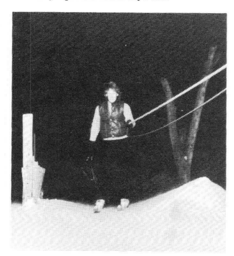
"Just get me to the top."