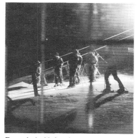
From the inside looking outside.