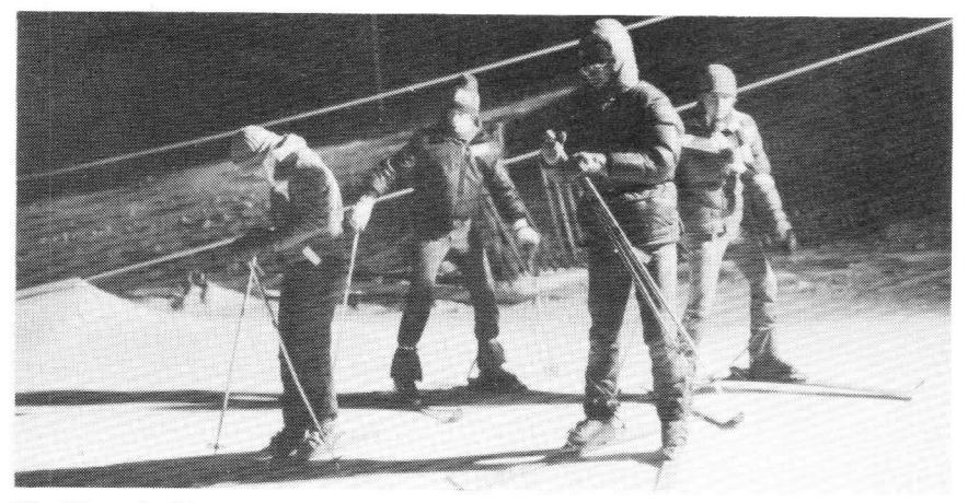
The Olympic ski team tryouts.