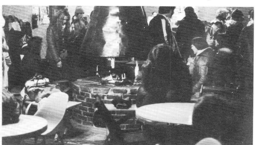
Gathered around the fire, the skiers warm up.