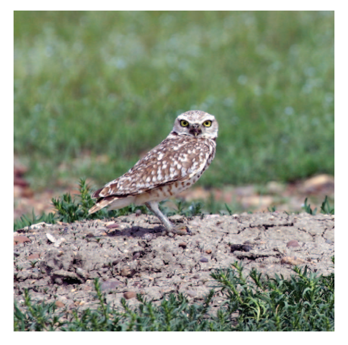
FIGURE 1. This Burrowing Owl rests atop an abandoned blacktailed prairie dog burrow on June 4, 2004, in Phillips County, Montana.

colonies (prairie dogs were absent) were monitored in subsequent years to check the status of their occupancy by prairie dogs. New prairie dog colonies were created almost yearly; we attempted to survey them for prairie dogs and owls soon after they were established. The study area and prairie dog survey methods are described in greater detail in Dinsmore and Smith (2010).