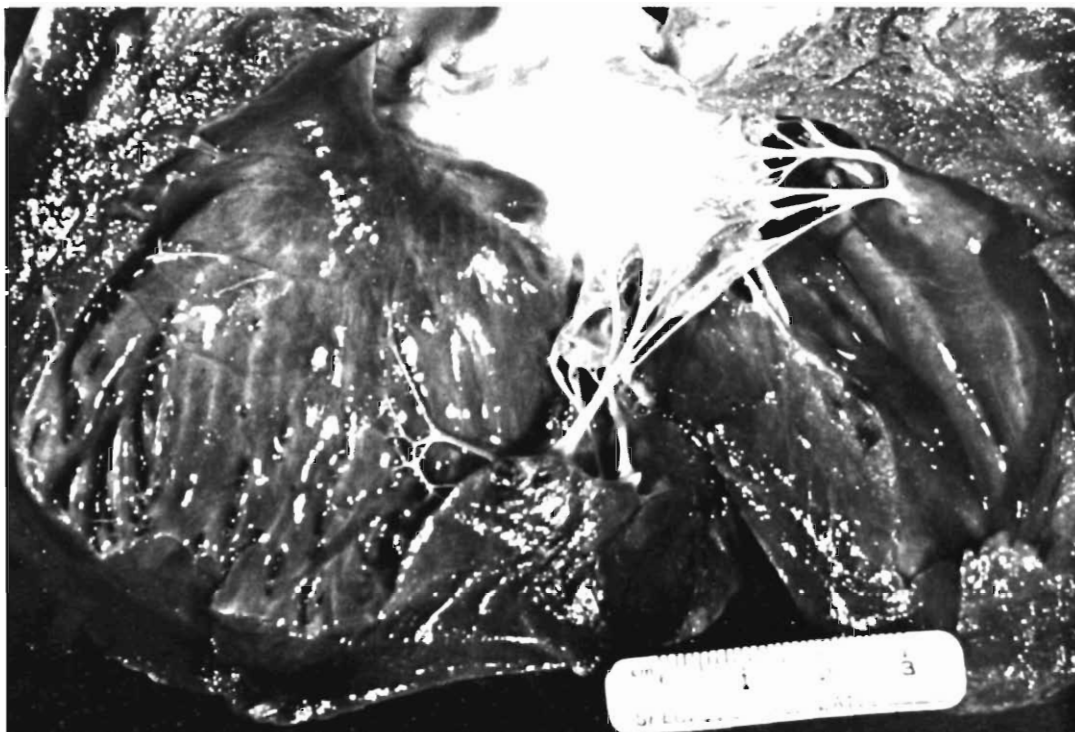
Necropsy revealed infarcted areas in the myocardium. Note the highlighted areas at upper left and upper right of photograph.