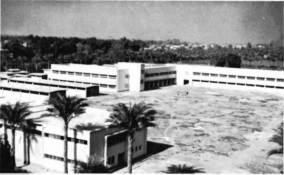
New buildings now house the Department of Veterinary Medicine and Surgery—University of Cairo.

school remained independent. The new school was well equipped with lecture rooms for anatomy and pharmacy as well as residential quarters for students and staff. A hospital was designed to accommodate 110 animals. These new facilities attracted students and the enrollment was increased from 50 to 122. Additional European professors were appointed to the school. By 1836 the course of study was increased to five years and admission to the school was limited to either holders of the Secondary Education Certificate or graduates of the School of Languages. The courses studied were chemistry, surgery, clinical pathology, hygiene, medicine, pharmacology, and therapeutics.