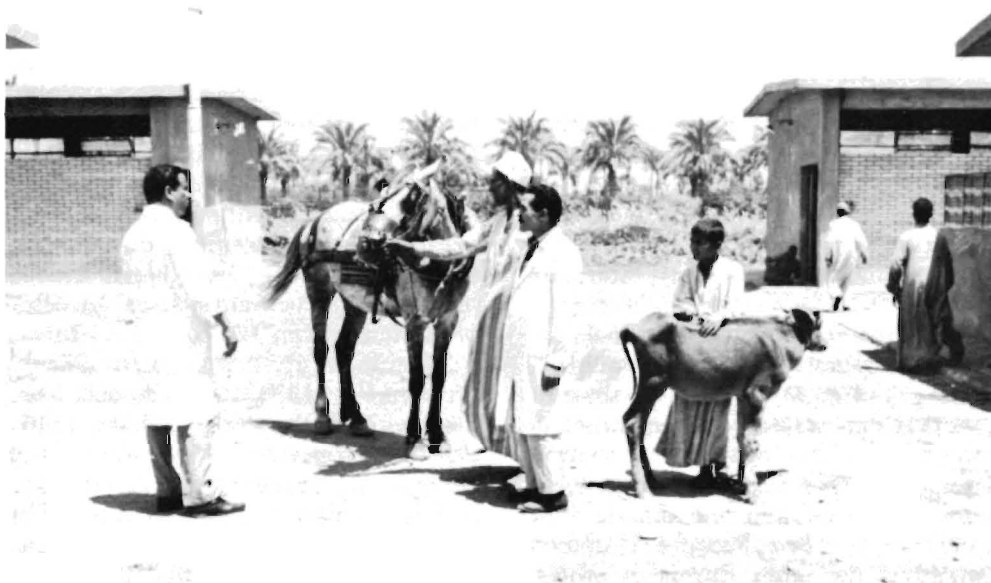
Typical cases being presented to the outpatient clinic—University of Cairo.

This huge increase in enrollment has created problems in connection with the physical facilities and has placed an unusually heavy teaching load on the staff. Because of this, a new school for veterinary education has already been established at Assuit University. This school enrolled its second class of veterinary students in the fall of 1963. It is now contemplated to establish a third Veterinary Faculty in the second five year plan starting in 1965. This school will be located at Tanta or in the Delta Mansourah. With three schools in the U.A.R. the present shortage in facilities and staff at Cairo University should be diluted. The U.A.R. will be unique with these three schools because they will all occupy new buildings. Plans are underway to complete the complex of veterinary buildings at Cairo University which will occupy an area of 12 acres. At present the basic science people still teach in old buildings, but a new administration building, morbid anatomy building, and clinic for the departments of medicine, surgery, and obstetrics were completed in 1960.