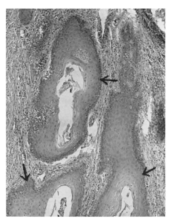
Fig. 2. Marked squamous cell metaplasia occurred in the prostate gland. x150.