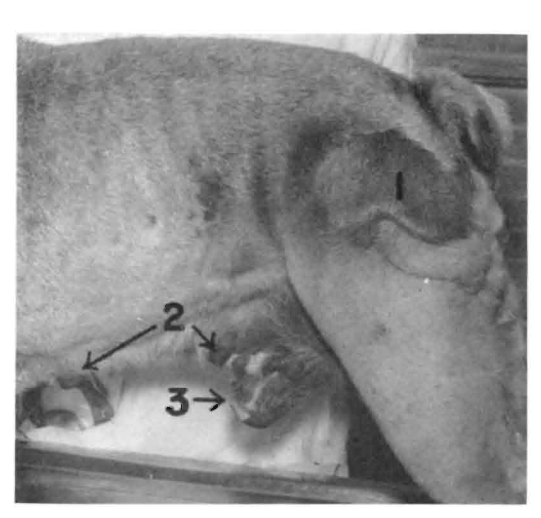
Fig. 1. Note (1) alopecia and hyperpigmentation, (2) enlarged nipples, and (3) pendulous prepuce.