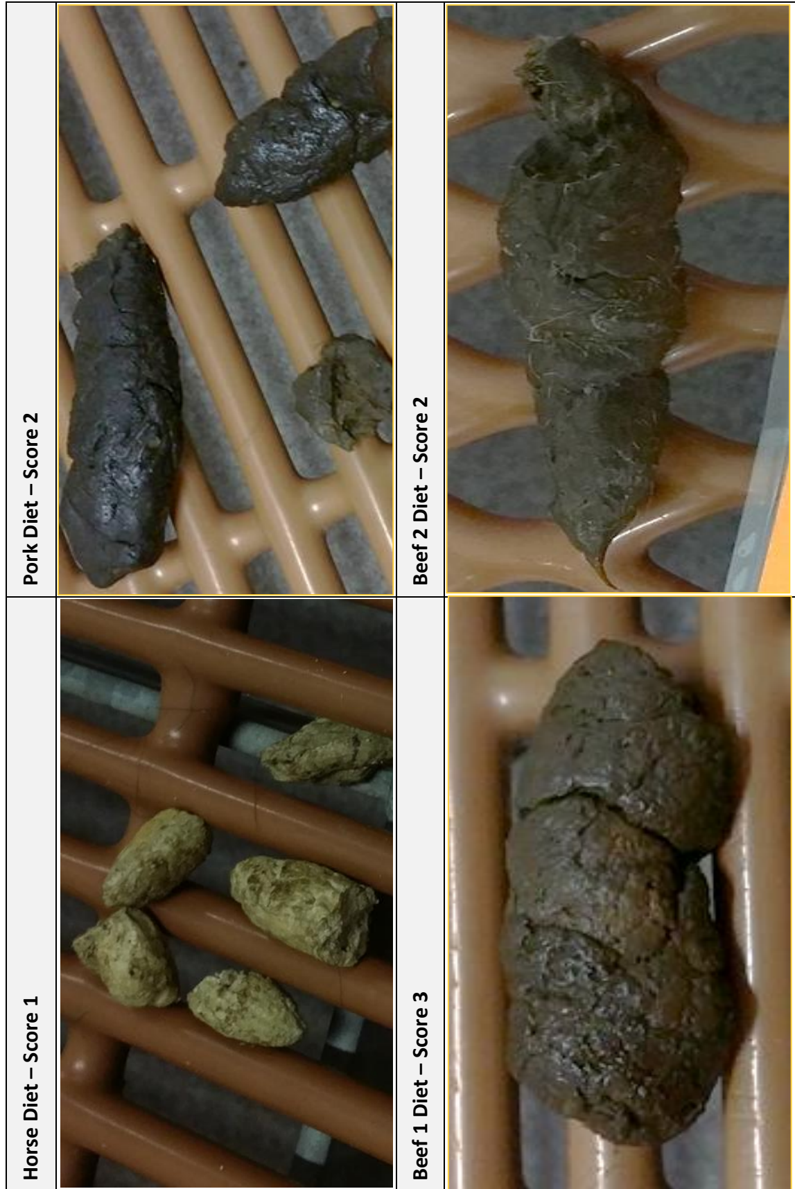
Figure 3.1: Stool samples from domestic dogs ( Canis lupus familiaris ) fed commercially available horse-, pork-, and beef-based raw meat diets and associated fecal scores.