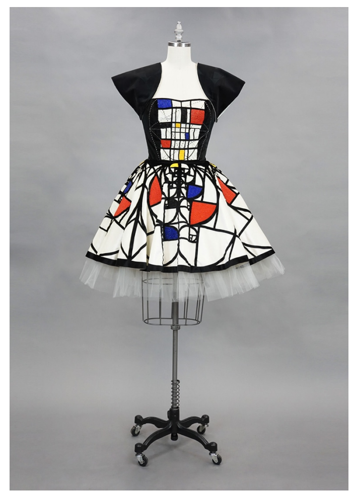
Figure 1. Front View