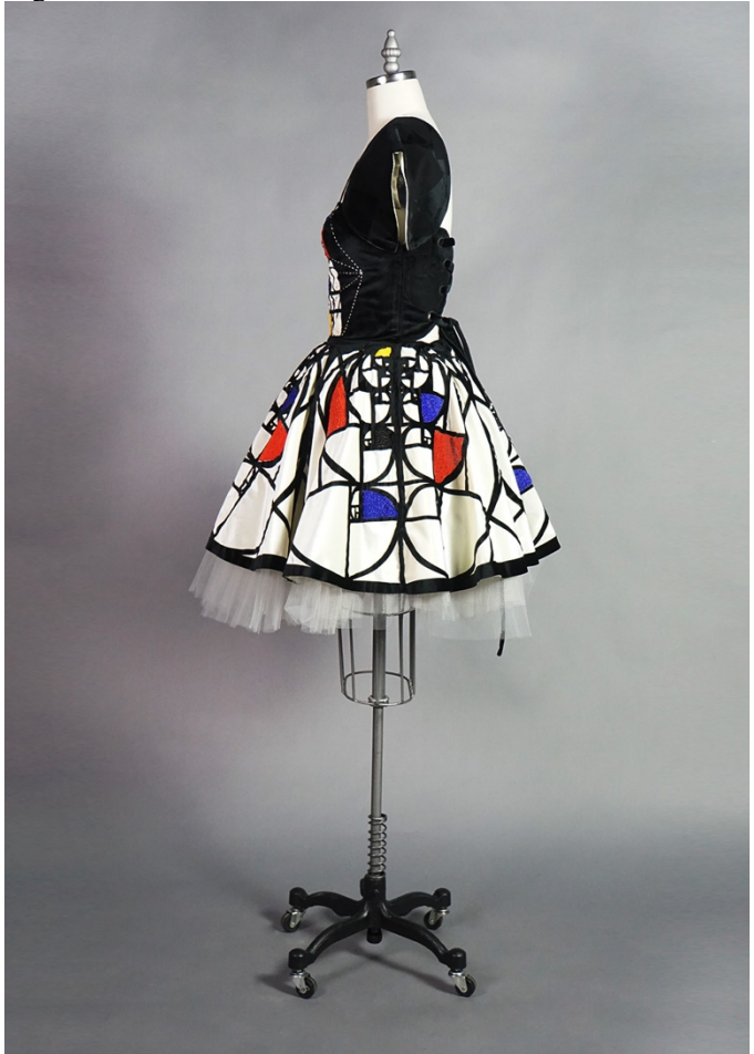
Figure 3. Side View