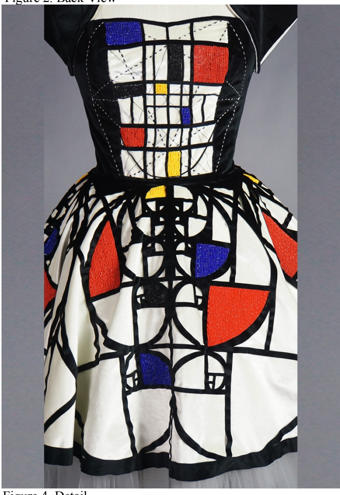
Figure 4. Detail