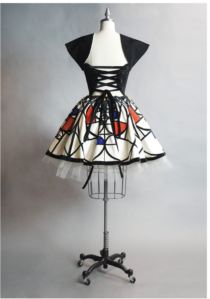
Figure 2. Back View