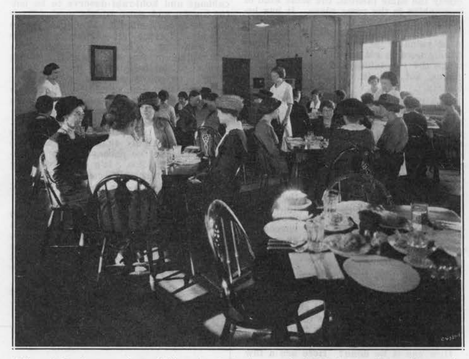
"Chem." Professors, Army Officers and Engineers, As Well As the Home Economics Faculty Members, Count Themselves Lucky When They Are Able to Secure a Table for the Quarter

The black enameled tables, forty pretty Windsor chairs to match and several service tables—these complete the Campus Tea Room. At noon the tables are set with pretty silver, dainty paper doilies, gay old Haarlem china, and a bowl of cheery flowers. The luncheon is served in two courses and the girls themselves