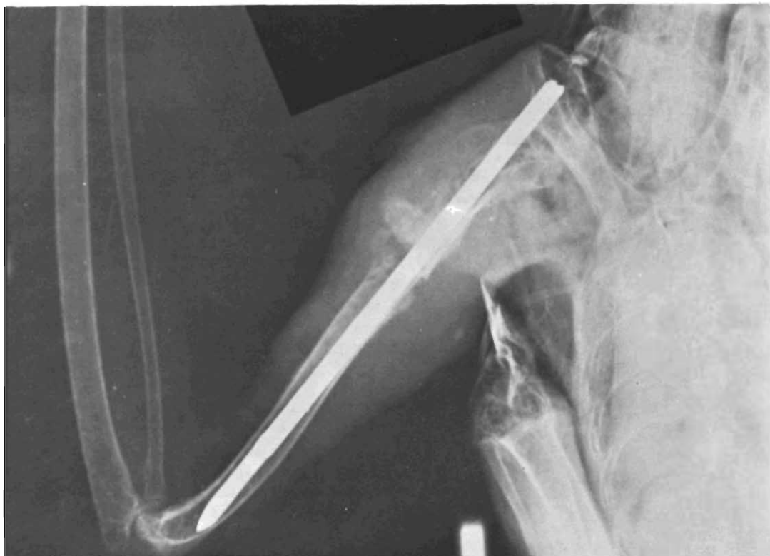
Fig. 3. A Steinman intramedullary pin was placed into the right humerus of this hawk. Notice the

rotational instability of the fracture site and the insult at the scapulohumeral articulation.