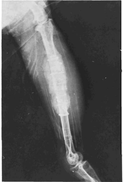
Fig. 4. AP and lateral views of a great horned owl tibia repaired using PMMA and cerclage wires. All the twists of the wires were imbedded into the PMMA.