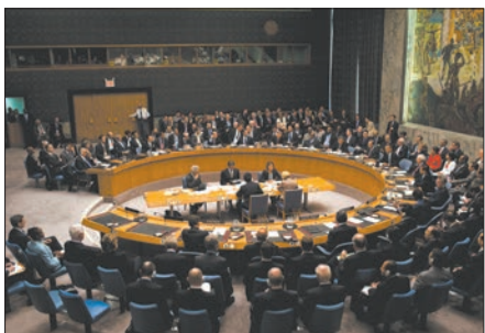
As the world puts its trust in the UN to provide essential peacekeeping missions, the organization will continue to fail in that mission time and time again until all five members can reach a unanimous decision.

The charter of the United Nations points to four main purposes which the intergovernmental organization was created to achieve and maintain. The first such purpose states that the UN was founded “To maintain international peace and security.” The remaining purposes work to support this original premise.