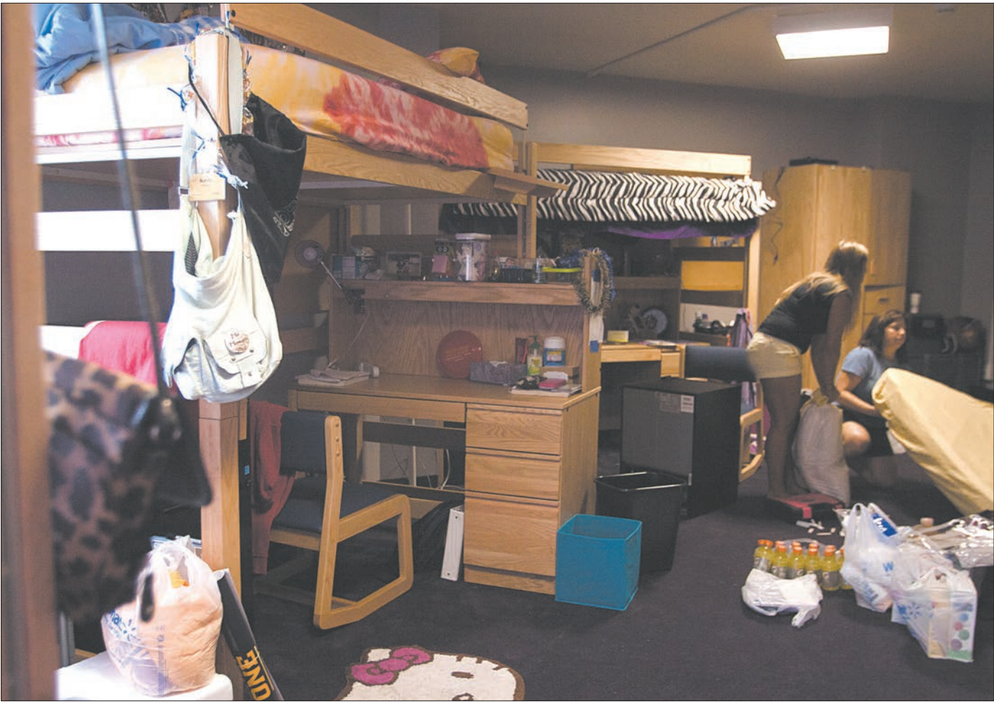
Iowa State Daily With many students looking for place in Ames for the next school year, housing expansion needs addressed quickly. Columnist Cummings suggests the university should collaborate with the city of Ames to resolve the lack of available housing for a growing student population.

Online feedback may be used if first name and last name, major and year in school are included in the post. Feedback posted online is eligible for print in the Iowa State Daily.