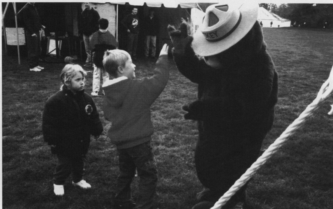
Smokey chillin' with the kiddies.