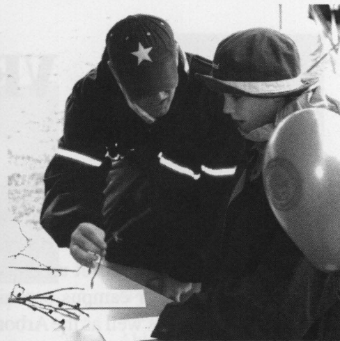
Some Forestry Tent visitors identify twigs of campus trees.