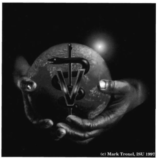
The Visions in Veterinary Medicine conference was created to "explore the dynamic issues and opportunities facing the future generation of veterinary professionals."

sity College of Veterinary Medicine, was presented to an audience of approximately 350 veterinary students, veterinarians, and industry representatives at the "Visions in Veterinary Medicine: Facing a New Millennium" conference. The conference, established by students of the Iowa State University College of Veterinary Medicine, was created to explore the dynamic issues and opportunities facing the fessionals." future generation