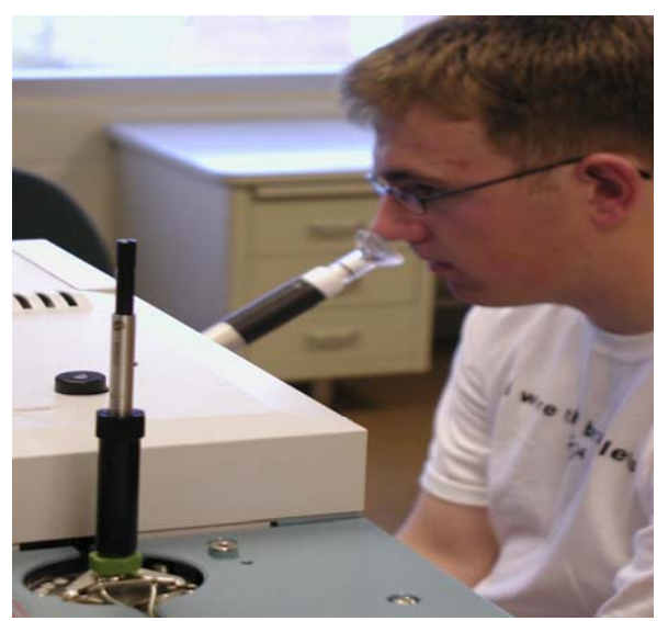
Figure 3. Panelist evaluate swine odor with multidimensional gas chromatography-mass spectrometer-olfactometry.