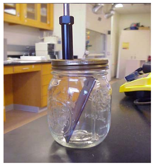
Figure 2. Headspace sampling of odors emitted from steel plates exposed in swine farm.