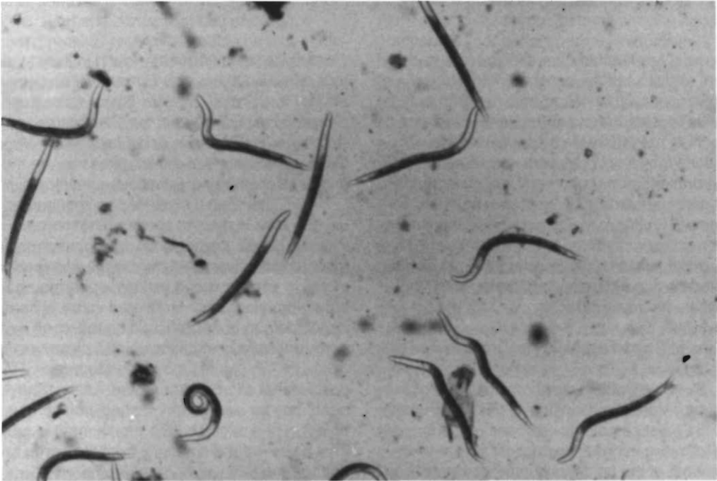
Figure 3. Larval form of Dictyocaulus viviparus recovered from a fecal specimen by use of the Baermann technique.