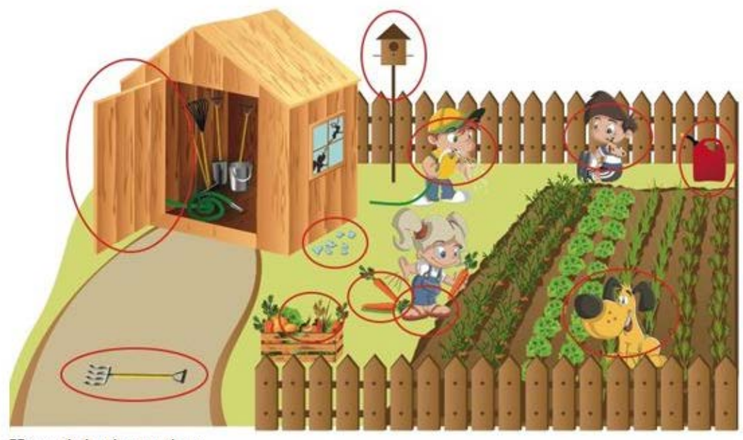
Figure 1. Answer Key for School Garden Hazard Identification Activity