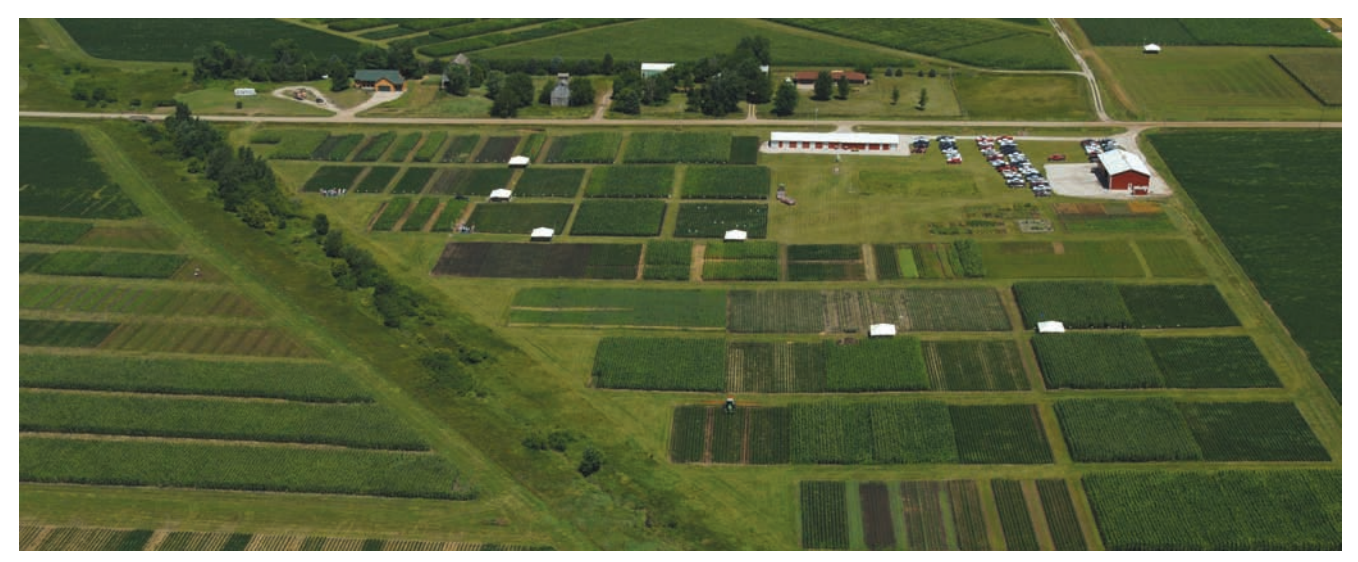
Aerial view of the Feel Extension Education Laboratory (FEEL).