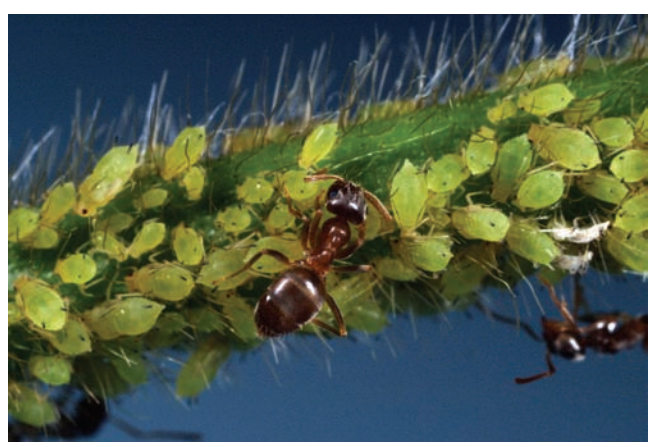
Crop Diagnostic Clinic sessions cover topics such as nitrogen use in corn and N deficiency stress sensing (top), tips for notillage soybean production (middle), and soybean aphid speed scouting (bottom). Check out the complete list on the left.

Brent Pringnitz is coordinator of the Agribusiness Education Program.