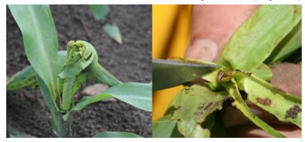
Photo 3. Stalk borer larvae can shred corn leaves and destroy the growing point.