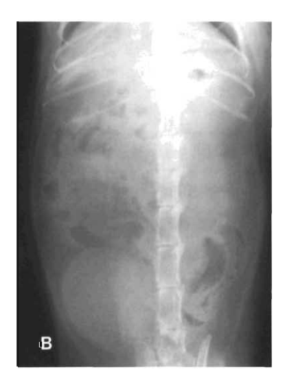
Fig. 1: Lateral (A) and ventrodorsal (B) views of the abdomen.