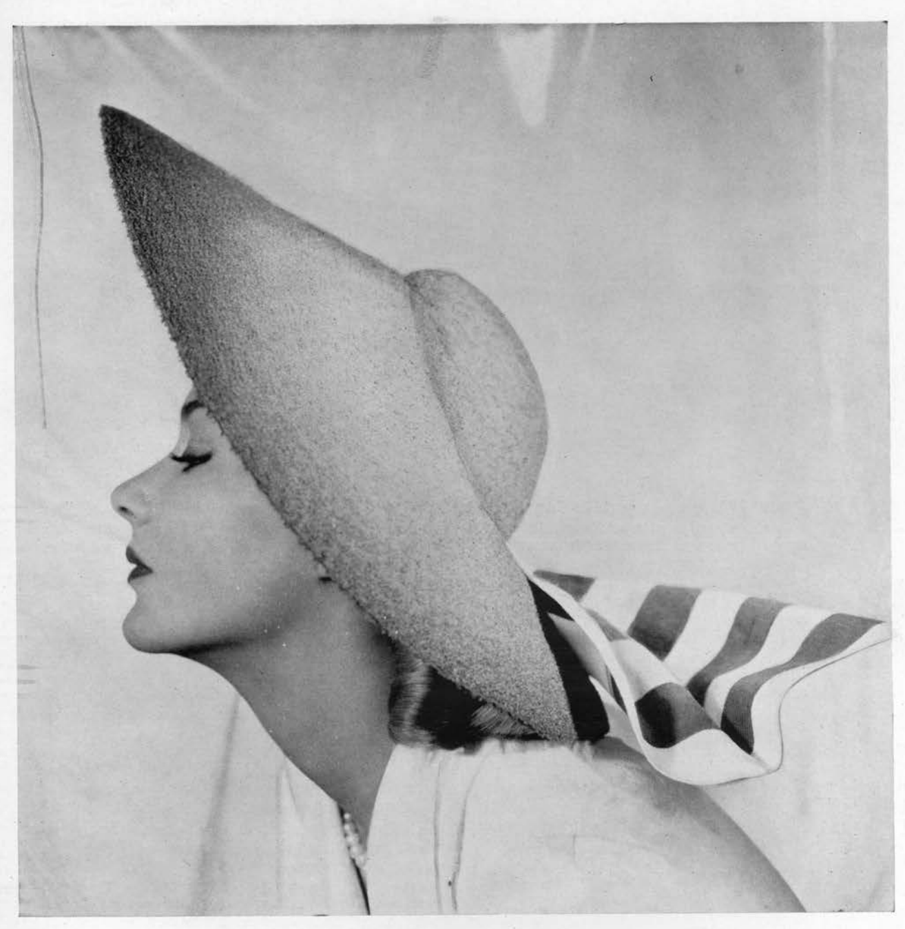
Blue skies smile on milady, looking exotic in a dashing circular straw with gay, striped streamers-very flattering to the profile!

nautical theme or navy blue scanty shorts with stitched plaits in front, complete with a middy blouse of cross bar piquè. To keep the wind and rain from your curly locks top the costume off with a piquè beret peaked with a red pom-pom.