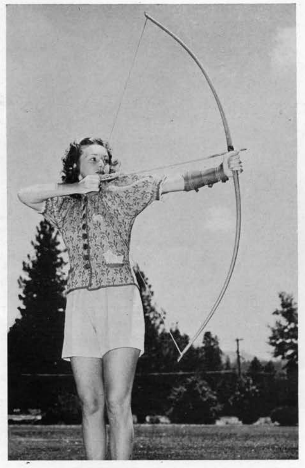
Archery, enjoyable played alone or in groups, is a sport favorite which develops arm muscles, an eagle eye and accurate aim.

These sports have held the limelight for a long time but now there are some "background" games demanding their share of attention. The fact that most of