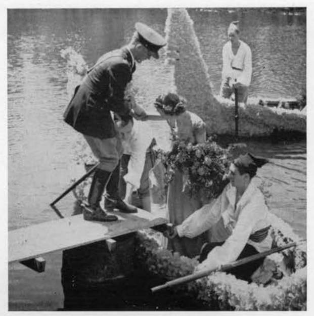
Pageantry intermingles with scientific displays as each department holds an open house during Veishea's festivities.

The dietetics section will feature the deterioration of total food value due to storage of strictly fresh food, food three to six days old, food one month old, canned food and frozen food.