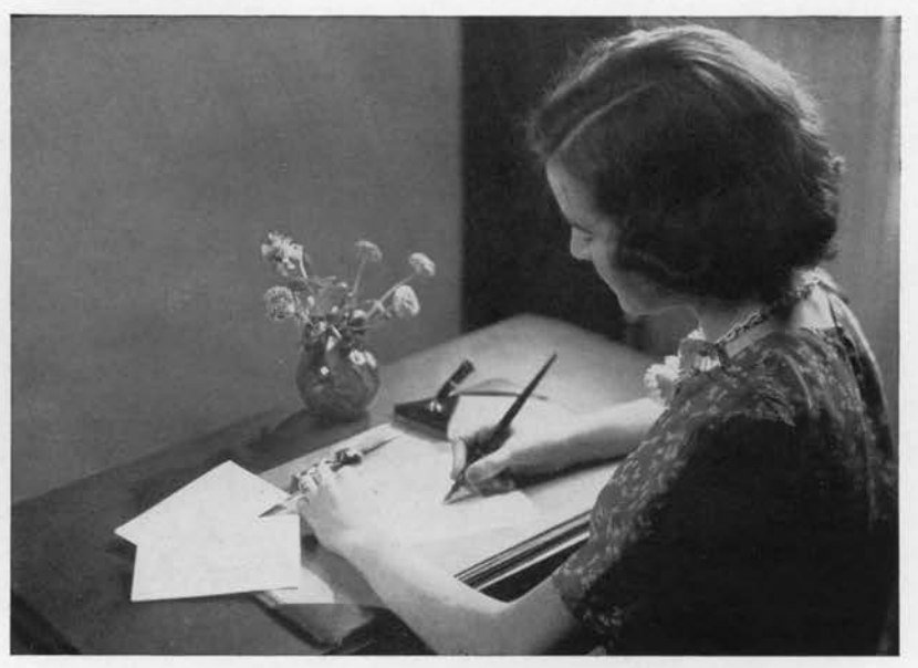
Make it possible for your potential employer to know your background before having a personal interview through a carefully thought out letter of application

Katherine Monson offers tips to the job hunter