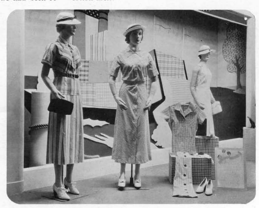
"and I don't mean a house dress at $1.98, or even one of its more glorified cousins at $5.98, that parade as identical quintuplets on sale in department stores."

Occasionally I find proof that the kind of cotton dress I want does exist. Last summer among the heavy hop sacking and coarsely woven voiles, among the ugly and the ordinary, I found a cotton dress that stood out like a jewel among junk. It was youthful—not kittenish; gay and colorful—not garish; smart—not severe; feminine—not fussy. But it was a size 16. And now summer is coming on again, and I want a cotton dress!