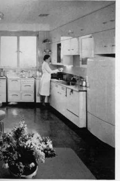
mpus speaker, appears in the Jewel Tears is the directs foods and equipment testing.

soluble resin to one surface of the fabric. The resin hardens as the fabric is glazed after which the filler is removed and the resin coat is broken by stretching. It is claimed that this permanent glaze is unaffected by either dry cleaning or laundering.