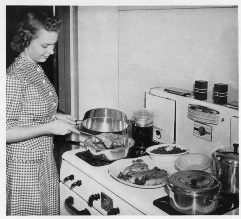
The duty of the young homemaker is planning her food preparation and housework but there's also time for pleasurable study.

age and romance whenever asked to tell them. The first few years of married life, especially if spent in a small furnished apartment, can make an unambitious, dull and dissatisfied woman out of an intelligent and educated girl. Each young wife must work out her own problem of activities, to make the