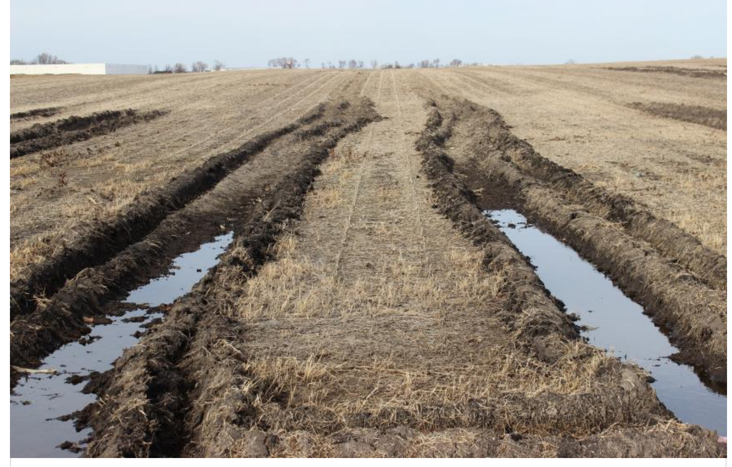
Ruts made when harvesting soybean under saturated soil conditions.