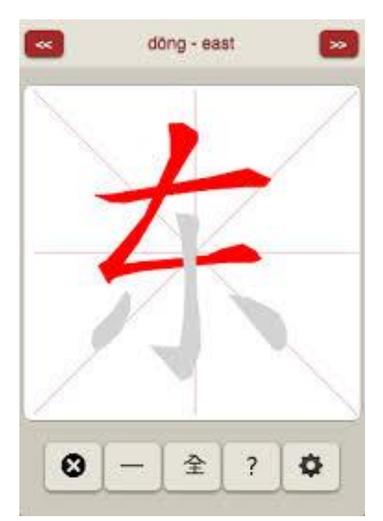
Figure 7. Writing software demonstration