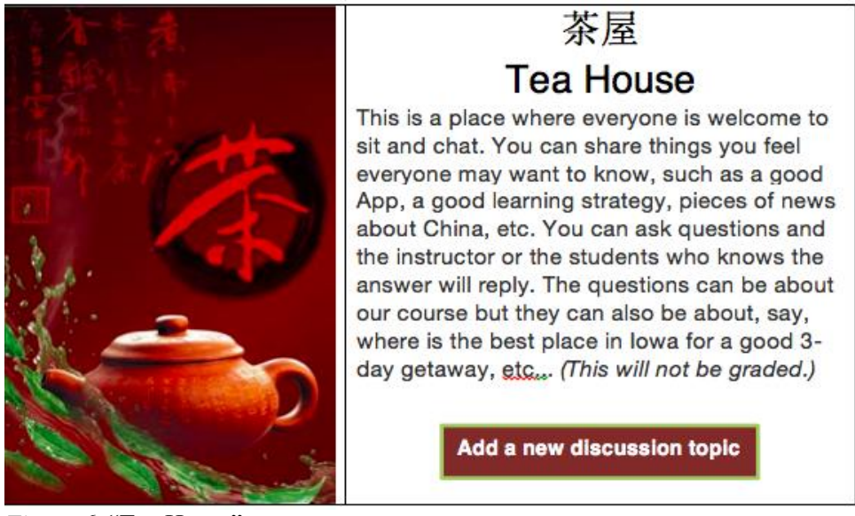
Figure 6. "Tea House"

Another way to build online community is to have an area where students can exchange information. You can call it Tea House, Coffee House, Lobby Area, Chinese Garden, or any other name you consider appropriate. In this forum area, students can talk about learning methods and strategies, their experiences in Chinese learning, their knowledge about Chinese society. They can even talk about information unrelated to the study of Chinese (Figure 6).