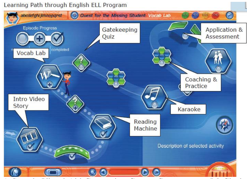
Figure 4 . A Sample Visual Aid Connecting Course Components. (McCloskey et al., 2008, p. 187)

Figure 3. An example of reading practice with assistance provided at different learning stages