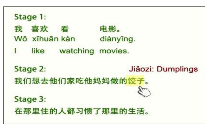
Figure 3. An example of reading practice with assistance provided at different learning stages

Stage 2: Mouse-over or clickable translation assistance available when needed Stage 3: Assistance gradually withdrawn