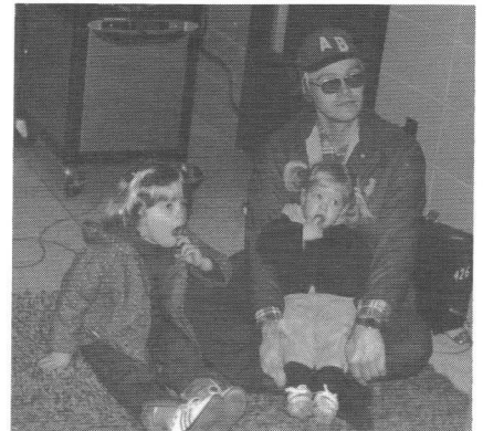
People of all ages enjoyed the VEISHEA Display