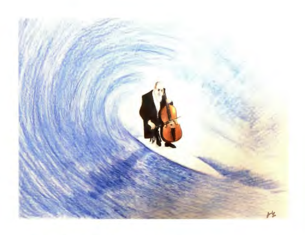
Flow State (2016) By Javaid Eid Pencil color on paper