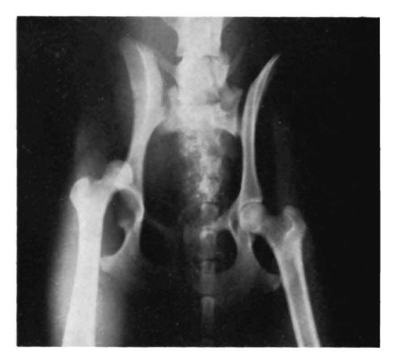
Figure 2. A "dorsolateral' coxofemoral luxation.

A skin incision is made starting one to two inches proximally to the greater trochanter and continued distally directly over the long axis of the femur to a point two to three inches below the greater trochanter. The skin is separated from sub-