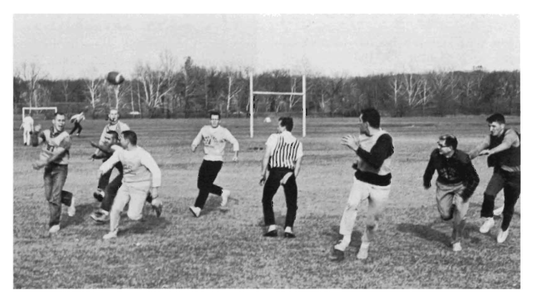
Seniors (light) pass in a game against faculty (dark).

After much hesitation and prodding by the seniors, the faculty accepted a challenge to play a game of touch football.