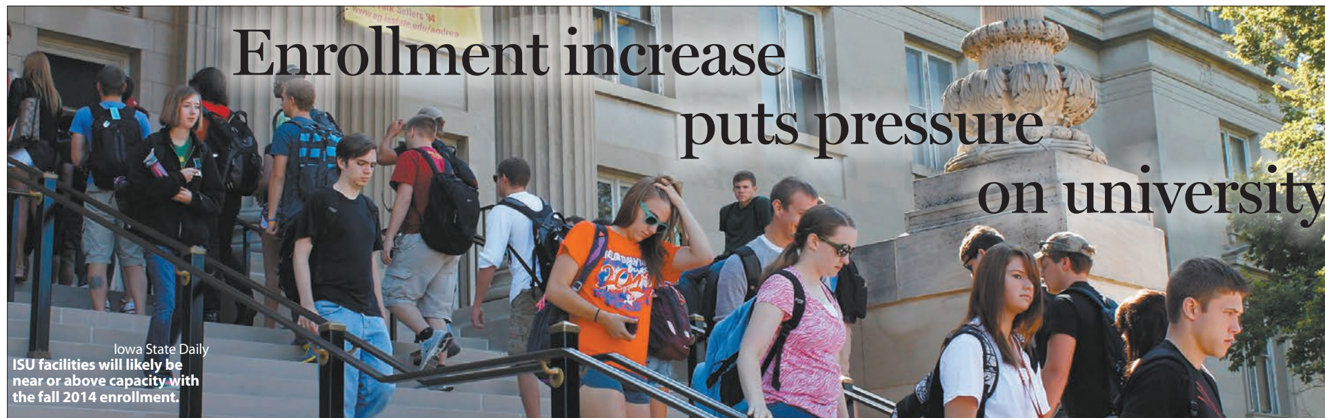
Iowa State Daily ISU facilities will likely be near or above capacity with the fall 2014 enrollment.