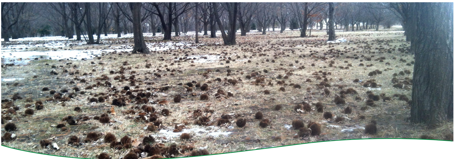
Chinese Chestnut husks litter the orchard floor.