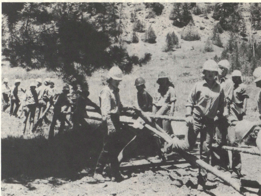
The crew builds a corral at spike camp.

We cut 30-foot poles to push ourselves across but when the water got deep, it was bail out and frog kick. One poor guy got his pole lodged in some mud and the next thing we knew, he was stranded in mid-air as the raft went out from under him.