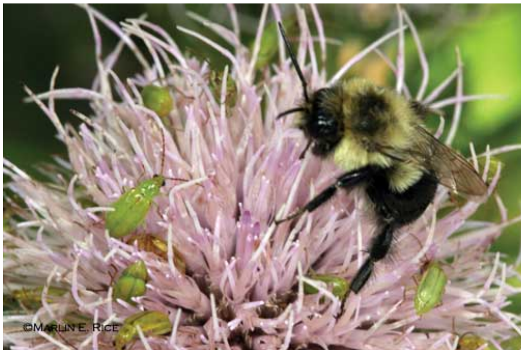
Adult northern corn rootworms on squash bloom.