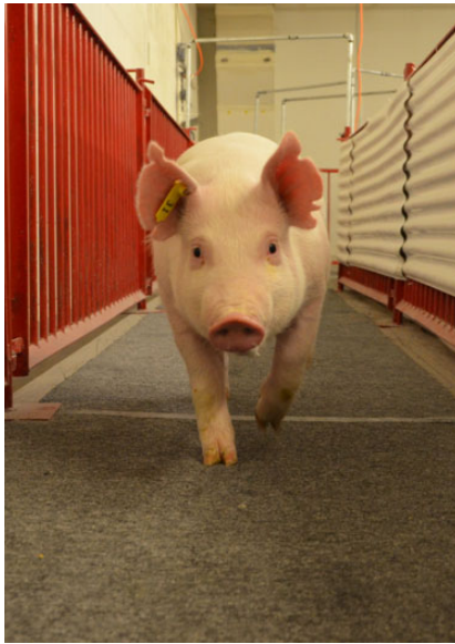
Figure 2. Gait analysis. The track is ~15 meters with the central 5 meters containing 33,000 embedded force transducers (Zeno, Protokinetics, Havertown, PA). The pigs walked back and forth across the track, and data are collected bidirectionally.