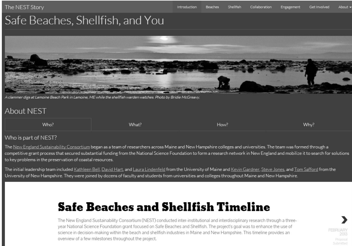
Fig. 2. The first main page of Safe Beaches, Shellfish, and You . Site navigation can be seen along the top of the page, with project overview information in the middle. Note the interactive timeline at the bottom of the image.

The content on most of the remaining pages follows a fairly consistent format. First, the reader finds a banner image at the top that provides a visual example of the page's topic. Immediately below is written reporting that introduces NEST's research and involvement with that topic. Following the story (or, more often, embedded between paragraphs) come visual, interactive, and/or media pieces that further illustrate the written material and provide different opportunities for meaning-making. Specifically, the two pages that deal directly with natural resources ("Beaches" and "Shellfish") include additional experiential and immersive media. On the "Beaches" page, there are two unique ways that the reader can choose to become a co-creator of the story. In the middle of the page after the main written piece, readers can find an embedded interactive window. This window includes "photospheres," images of 5 beaches in New Hampshire and Maine presented through scrollable omnidirectional imagery that sports interactive features similar to Google's popular Street View technology. Just below is an audio piece of the sounds at one beach. Below that are panning videos of 4 beach locations.