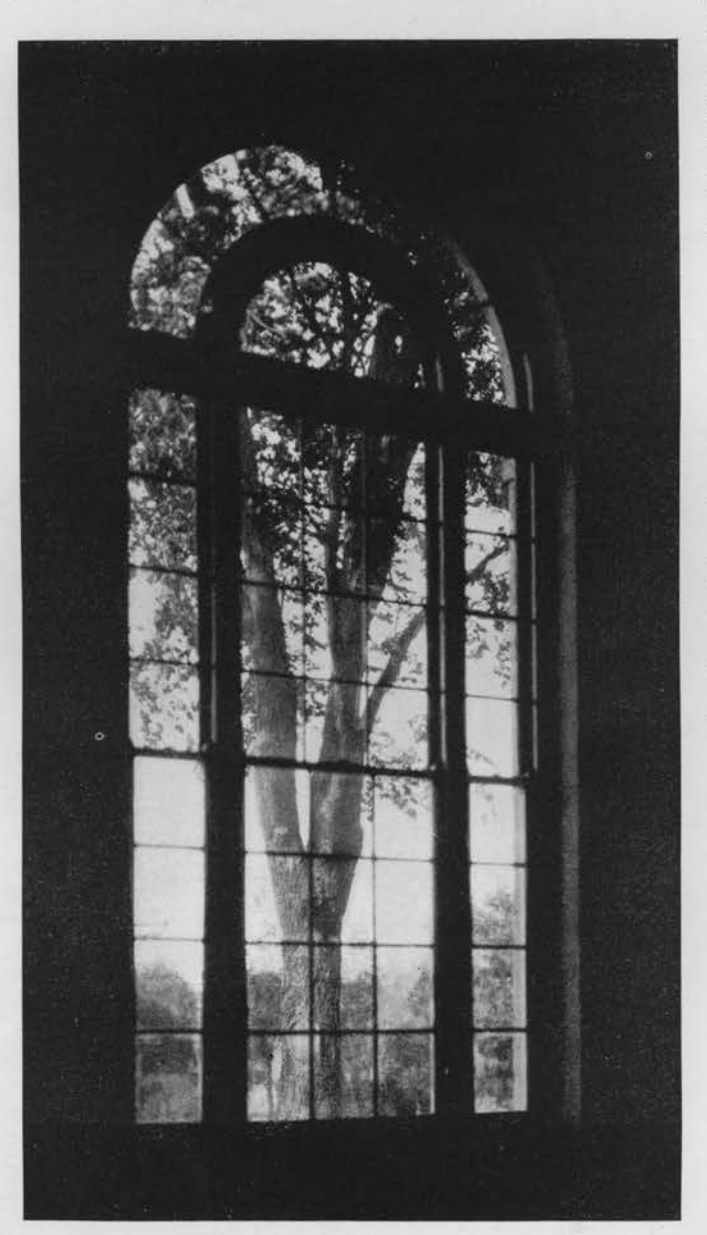
Outlook From a Window in MacKay Auditorium.

Any attempt to describe the building is inadequate at best. Its fine proportions, its dignity and strength, its unity and beauty, in addition to its suitability for many purposes, fit well with the beauty of the campus and the education of young women in appreciation of beauty.