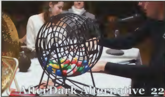
After Dark Alternative 22