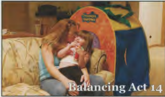
Balancing Act 14