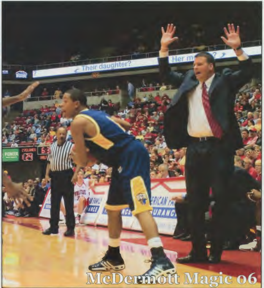
McDermott Magic 06