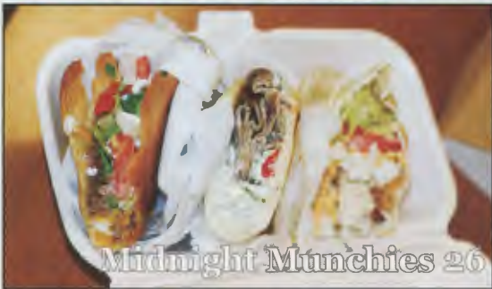
Midnight Munchies 26