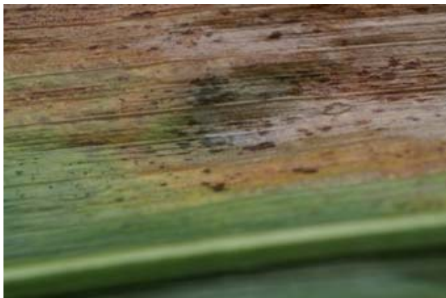
Figure3. Characteristic freckling seen on Goss's wilt lesion