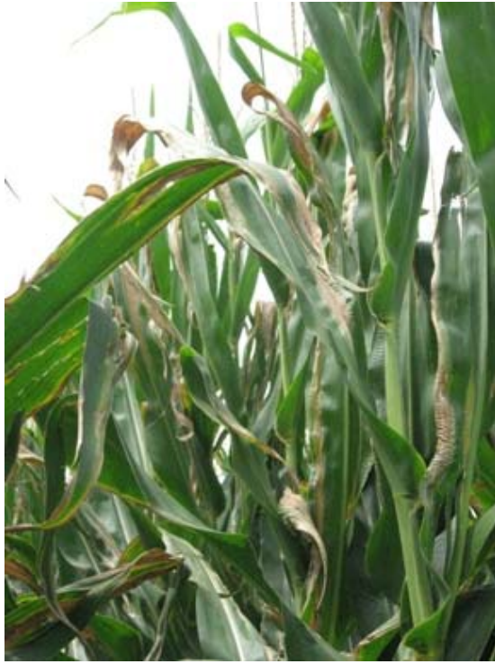
Figure1. Leaf blight symptoms of Goss's wilt