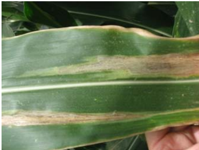
Figure2. Characteristic lesions of Goss's wilt