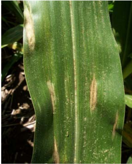
Figure 5. Cigar-shaped lesions of northern corn leaf blight