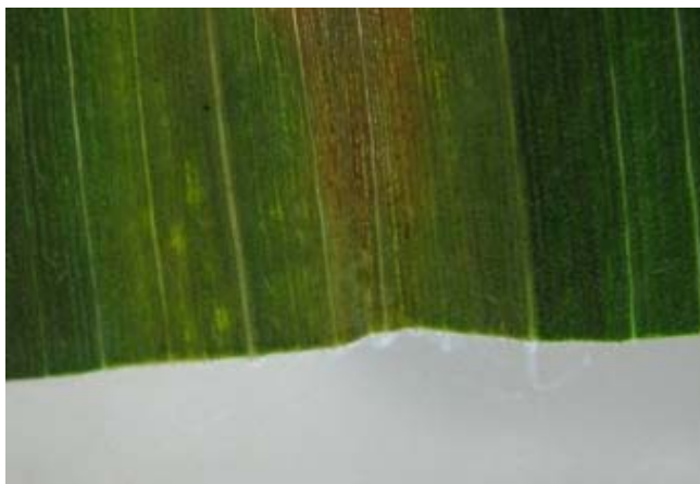
Figure 4. Oozing caused by Goss's wilt