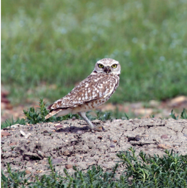
FIGURE 1. This Burrowing Owl rests atop an abandoned black-tailed prairie dog burrow on June 4, 2004, in Phillips County, Montana.

colonies (prairie dogs were absent) were monitored in subsequent years to check the status of their occupancy by prairie dogs. New prairie dog colonies were created almost yearly; we attempted to survey them for prairie dogs and owls soon after they were established. The study area and prairie dog survey methods are described in greater detail in Dinsmore and Smith (2010).