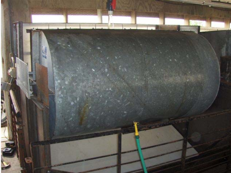
Photo 1. Tip tank shown in upright position.

Photo 1 shows an upright tipping or flush tank at the end of the barn. Each pit had a 900 gallon (1.2 m diameter) and 700 gallon tank (1.0 m diameter) side by side. The tanks were cylindrical and would rotate as they became full due to the change in center of gravity. The tank rotated towards the exterior of the building and a sloped piece (shown under the tank in Photo 1) ushered the flow in a straight shot into the gutter under the slats.