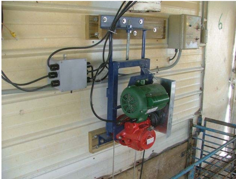
Photo 5. Safety features of the scraper system above the floor.