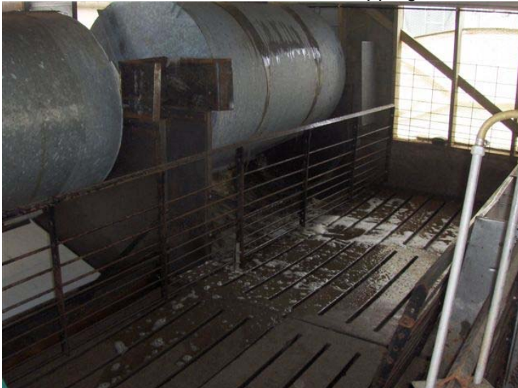
Photo 2. Flush tank has discharged its contents.

Photo 2 shows the tanks as it discharged. The water rushed through the shallow 20 cm (8") pit as a wall of force to remove manure solids in the channel. Notice the extra room needed at the end of the barn to accommodate the tank. Space immediately in front of the tank was needed also for the wall of water created after tipping.