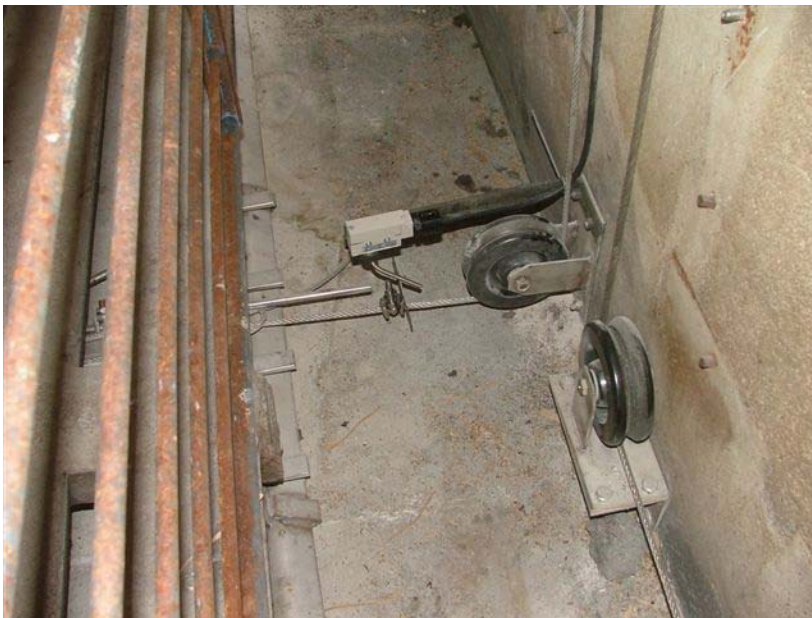
Photo 4. This scraper system showing pulleys with cable leading to the motor.

A limit switch is shown in Photo 4 to prevent the length of travel of the scraper to interfere with the pulley guide wheels. Guide wheels were plastic or cast. Notice the cable is stainless steel rather than galvanized to prevent corrosion due to constant exposure to pit gases. There were two drive units per barn. Scrapers were 2.6 m (8.5 ft) wide and barn was 12 m x 67.2 m (40'x220'). Each receiving pit was 5.5 m (18') wide. Each tip tank (4 per barn) was 2.4 m (8') wide. A galvanized tank is projected to last 15 years. The wear part is the cam.