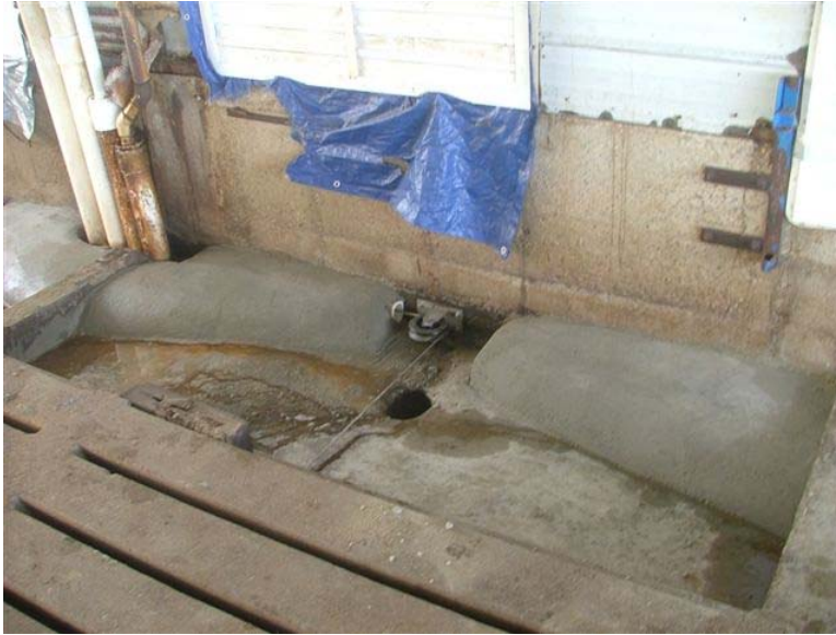
Photo 3. Concrete diverters used in the scraper system.

pump was used per tank and one \frac{3}{4} hp motor per scraper. The size of the drain hole was 0.2 m (8").