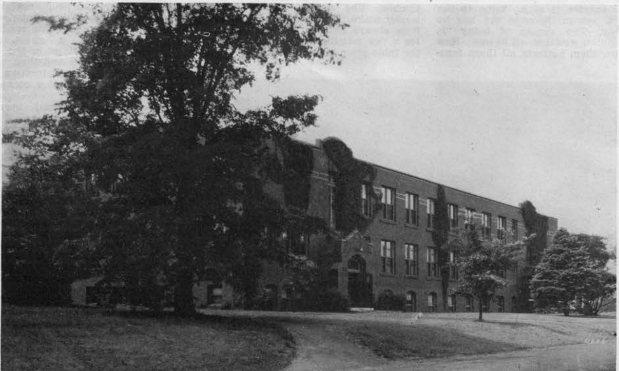
The Home of the Division of Home Economics

Second, the material side which has to do with the every day routine of family life. In modern family life the tendency is to develop the individual.