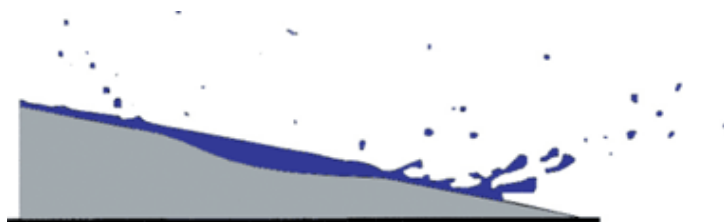
Figure 2. Raindrop splash pattern from a sloped landscape.

After a rainfall event, soil crusting is a significant problem, particularly on soils with low residue cover. The surface crust is caused by a breakdown of soil aggregates due to raindrop impact. The raindrop splash detaches particles that fill soil pores. When rapid drying occurs, a hard crust layer can form in the top 2 inches of the soil. Soil crusting is troublesome when it develops prior to seedling emergence. Additionally, soil crusts create conditions that are extremely conducive to soil erosion during following rainfall events.