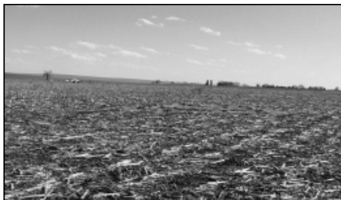
Grazing corn stalks at .67 acres per cow for 28 days had minimal effects of residue cover and surface roughness.

Stored feed costs represent the largest cost associated with beef cow-calf production. Allowing cattle to graze corn crop residues during the fall and winter would significantly increase the profit for cow-calf producers. In spite of this potential economic benefit, some producers limit the grazing of corn crop residues because of the perception that by causing soil compaction and roughness such grazing may have negative effects on subsequent crop production. Researchers for this project chose to study whether there were significant detrimental results stemming from winter grazing of corn residues.