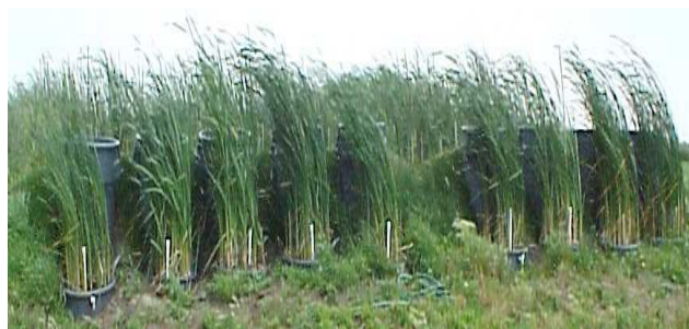
Figure 2. Panoramic view of the nine microcosms.

Both the soil infiltration areas and the wetlands were filled with topsoil (A horizon) of the Clarion loam soil from the surrounding land. The soil was packed into the containers to a bulk density of 1.3 gm/cc, similar to that of local field conditions. Cattails ( Typha spp.) were planted in the wetland containers and allowed to establish in saturated conditions. Although duckweed ( Lemna spp) was not specifically planted in the wetlands, they emerged in 1998, but not in 1999. A grass mixture was planted into the infiltration areas in 1999, but did not survive in the manure treatment containers because of high ammonium-N concentrations and ponding of the manure for extended periods of time.