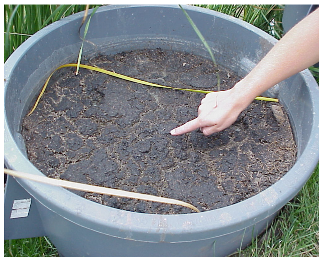
Figure 3. Infiltration containers in this photograph exhibit crusting and accumulation of the manure at the surface, decreasing the rate of infiltration over time.

Only a small amount of NO 3 -N (1.3 and 0.2 mg/L in 1998 and 1999, respectively) was present in the liquid swine manure that was applied to the infiltration areas. The NO 3 -N levels increased dramatically in the infiltration area effluent when compared to the influent. This increase supports the