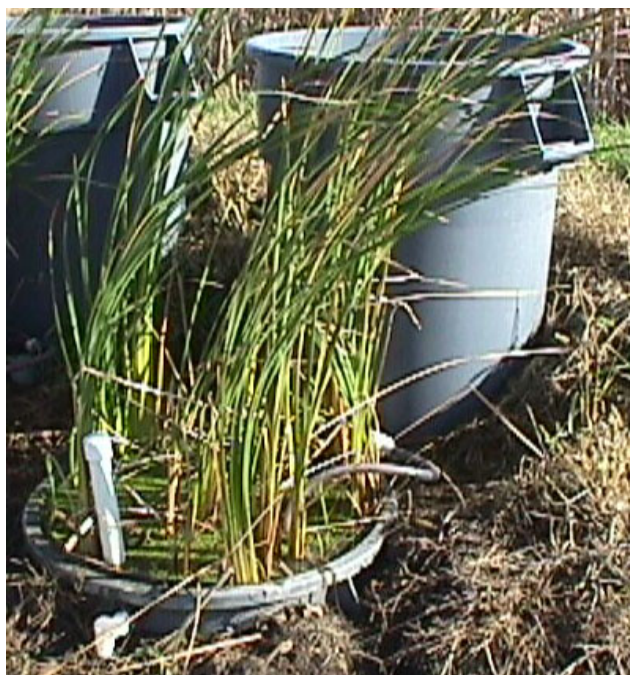
Figure 1. Close-up view of an individual system and its components.

To facilitate liquid removal a 2.5-cm perforated polyvinyl chloride (PVC) pipe was installed at the bottom of each soil infiltration container. The percolated effluent entered the wetlands via this piping to simulate a field tile drainage system. The soil infiltration areas were separated from the wetland areas by a valve that could be turned on to allow immediate flow between the two containers, or closed to simulate the lag time that could exist in a field tile drainage system. A strainer cup positioned in the valve apparatus allowed samples to be taken as necessary. The flow then emptied into the wetland through a perforated ring around the top circumference of the wetland, which allowed equal distribution of the effluent. A perforated 2.5-cm PVC pipe was also positioned at the bottom of each wetland to allow for additional water sampling as needed.