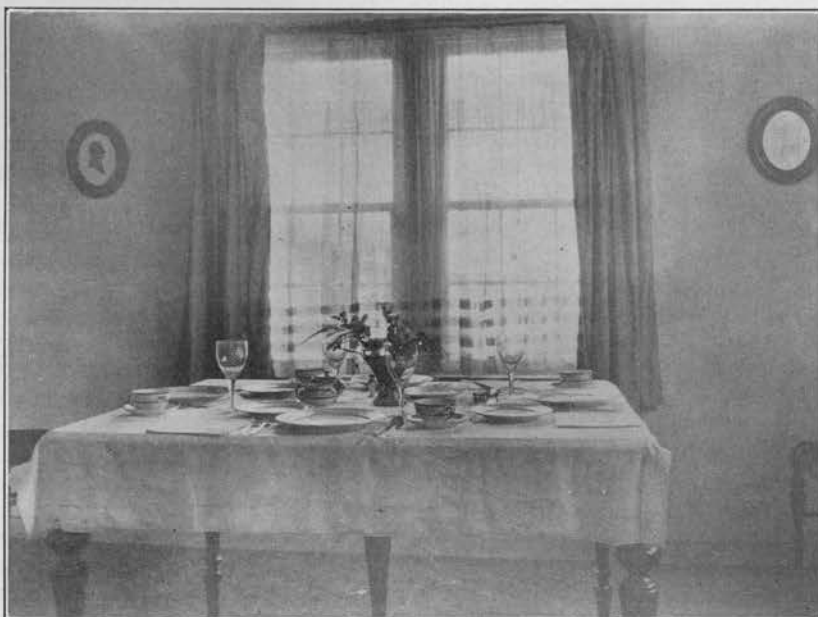
A well set table is the first requisite of a charming hostess.

Undoubtedly, the first table was a flat rock or log with a stump or smaller stone for a chair. Table cloths were unknown for hundreds of years. For many years after their introduction