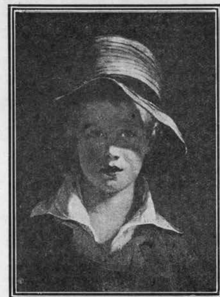
"The Torn Hat" by Sully is Most Appropriate for a Boy's Room

A general or family library may have pictures that express some interesting character or some writer or place connected with these subjects. If the lib-