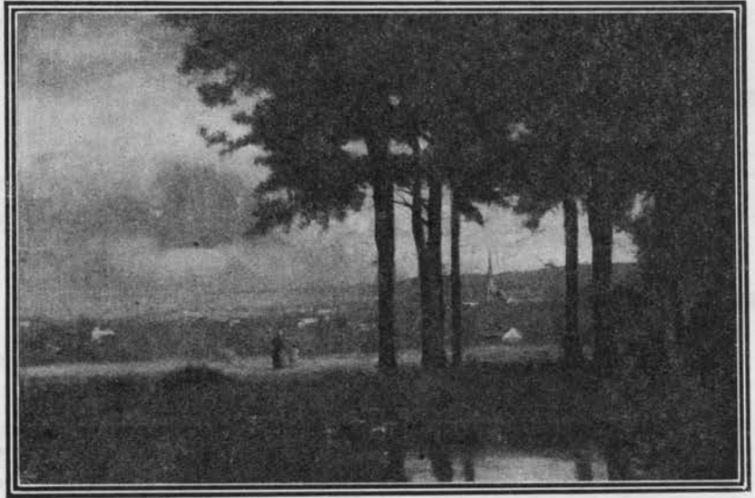
This Landscape Scene is Well Suited for Either Library or Dining Room