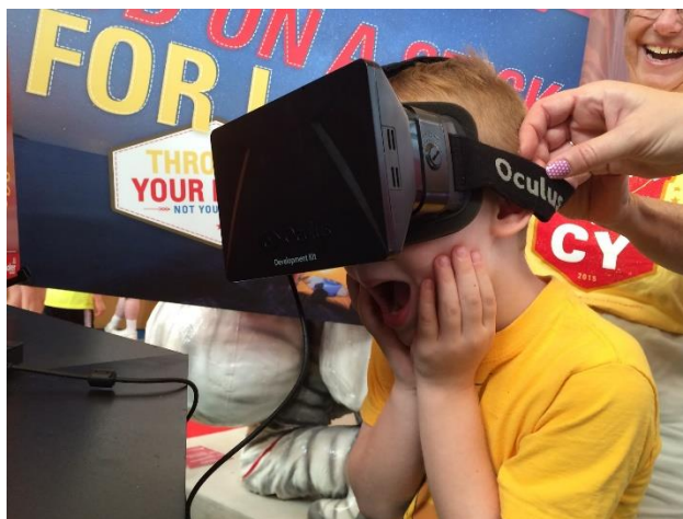
Figure 1 - Student reaction to the Oculus Rift headset

The second headset is programmed with a custom virtual roller coaster on central campus at Iowa State - a familiar setting to many Iowa residents. This ride requires only the headset and provides a very visceral virtual reality experience with the roller coaster rushing between and through buildings and careening up, down, and around central campus. This is often a highlight experience of the FLEx, as the feeling of being there is heightened by the perceived action of the roller coaster. The SEE module is also an opportunity to present smart-phone virtual reality like Google Cardboard or augmented reality experiences through tablets, which are more easily replicated at schools or homes due to the lower cost of entry.