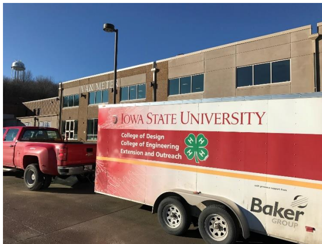
Figure 2 - FLEx trailer at an event in Van Meter, IA

Additionally, the MAKE module offers hands-on, creative modular circuit building. Little Bits are color-coded modules that magnetically snap together for straightforward assembly, manipulation, and experimentation. These electronic building blocks are pre-assembled, so students simply snap them together like Legos instead of first learning to wire up electronic components on a breadboard. Students have the option of following along to create pre-built circuits from a workbook, or they may choose to experiment and make their own creation. This becomes an entry point to introduce the concepts of programming, which can be expanded in longer term workshop engagements using a Little Bit Arduino board. By allowing the logic of circuits to be physically manipulated in simple terms, the ideas of input, output, sliders, switches, splitting, loops, and sensors begin to have real meaning. 3D printing in the same space as circuit bending allows a crossover of prototyping objects and electronics which is an important learning connection to the emerging internet of things.