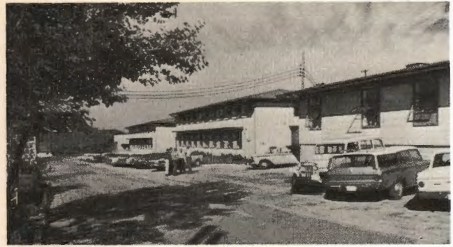
Spacious dormitories provide nicely decorated and comfortable living quarters.

The resident staff consists of 15 full-time Forest Service employees, whose efforts are directed toward providing what we hope will be the best and most favorable in-service training atmosphere in the country.