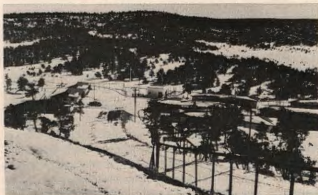
The Continental Divide Training Center is located on the Continental Divide, four miles south of U.S. Highway 66, (Interstate 40). Facilities which have been remodeled for academic use were originally constructed to house a U. S. Air Force Radar Base.

Formal training in basic functional and management activities tends to give guidance to the development of new employees. Formal training also provides our employees with a working knowledge of the elements of good instruction, which they are frequently called upon to use in their day-to-day contacts with others, both on and off the job. With the foregoing philosophy in mind, the Continental Divide Training Center was established with a dual objective. First is to fulfill the formal training needs of the Southwestern Region. We recognize and emphasize that the accomplishment of this objective