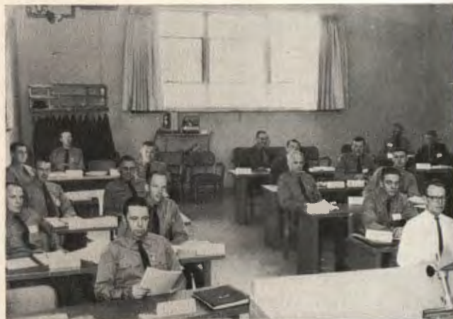
Comfortable chairs and adequate table space are provided each student.

The second objective is being approached through the selection of 14 pilot areas for study. These pilot areas include studies and operations in the fields of New Methods in Adult Education, Evaluation of Formal and On-the-job Training, Cost of Central Group Training vs. Training at the Forest or District Level, Training Library Development, Practicality of Using Full-time, Expert Instructors vs. Casual, Part-time Instructors and Research into New Types of Teaching Equipment, Aids and Facilities. Some of these areas are rather nebulous. Many have proven