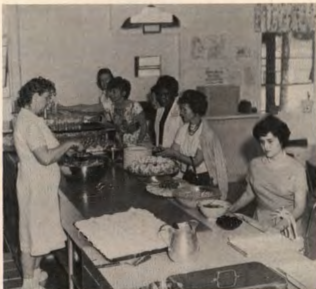
"Home-Cooked" meals are a specialty, served cafeteria style in a large dining room.

In addition to classroom facilities at the Training Center a field laboratory is rapidly being developed in the McGaffey area on the adjoining Gallup Ranger District. This area includes model recreation, timber sale, range, wildlife and watershed areas and a well planned and engineered trail and fire lookout. These facilities are used for field exercises in National Forest resource management. Three dormitories have clean, well-lighted, comfortably furnished single and double rooms to accommodate 75 trainees. Additional quarters are available for visiting instructors and guests. Delicious, well-balanced, home-cooked meals are prepared and served cafeteria style by a full-time