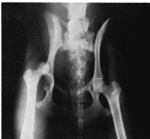
Figure 2. A "dorsolateral" coxofemoral luxation.

A skin incision is made starting one to two inches proximally to the greater trochanter and continued distally directly over the long axis of the femur to a point two to three inches below the greater trochanter. The skin is separated from sub-