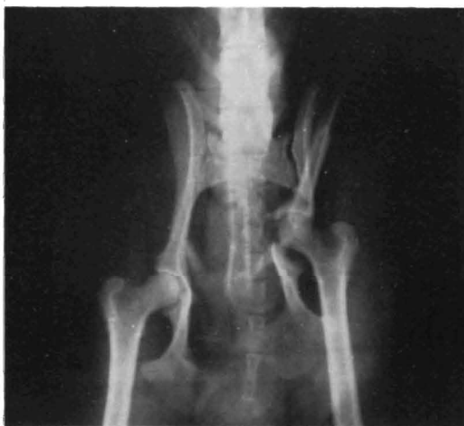
Figure 1. An "intrapelvic" luxation of the coxofemoral joint; an associated acetabular fracture exists.

The technique to be described here is a modification of the above reports. It has been employed at the Stange Memorial Clinic at Iowa State University over the past year. It should be emphasized that this method is intended for traumatic luxations which are easily reducible and which recur when pressure is applied. It should not be employed when fractures of the femur or acetabular structures are associated with the coxofemoral luxation.