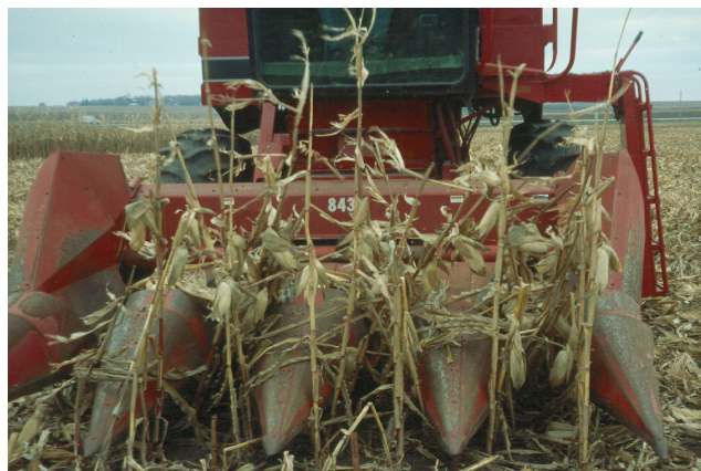
Figure 2. Some ears in 38-cm (15-in.) rows harvested by a 76-cm (30-in.) cornhead were lost as stalks were pushed forward before engagement by the snapping rolls.