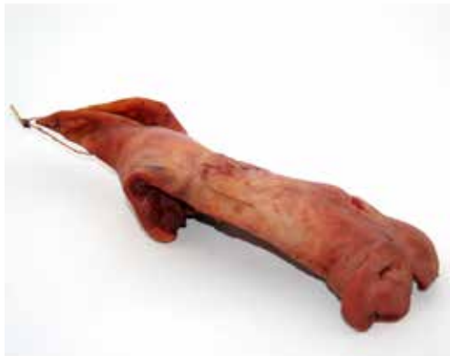
Figure 1 – Smoked head part of pigs' carcasses

Suspicious Salmonella sp. isolates were serotyped according to the Kauffmann-White scheme in the INIAV (Lisbon, Portugal), the National Reference Laboratory for Salmonella .