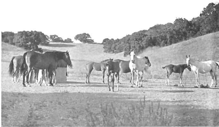
Pasture scene at the ranch

before an average crowd of 2,000 people. Last year 158,000 witnessed the performances.